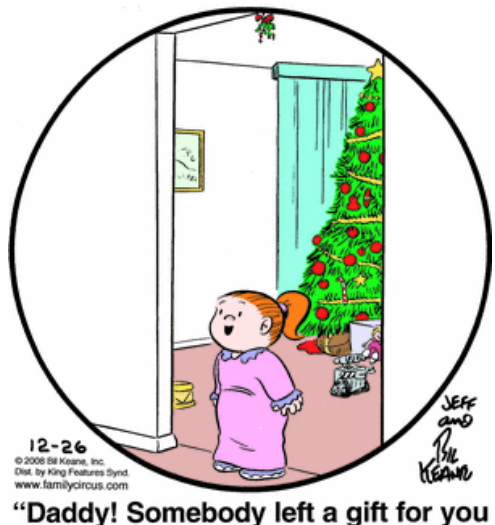
"Daddy! Somebody left a gift for you here under the mistletoe!"