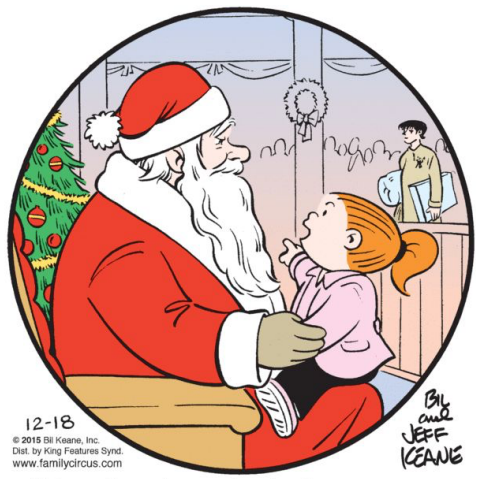
"How 'bout you just give me your cell phone number? Then I'll text you if I think of anything else."