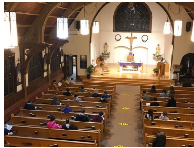
Saint Joseph's, Kentville.