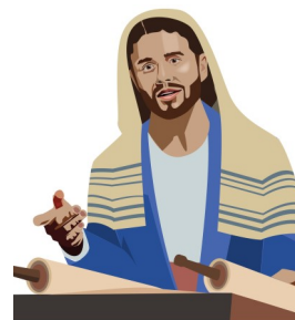
Jesus Teaches at the Synagogue in Nazareth

TO REQUEST A MASS INTENTION OR MASS CARD CONTACT YOUR NEAREST PARISH OFFICE